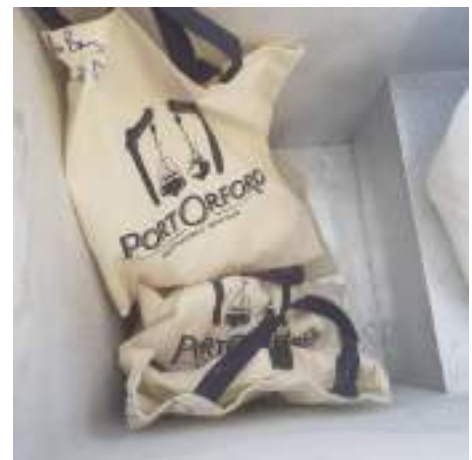
Member orders are placed in bags and stored in a freezer waiting for pick-up. Information can be found at: possustainableseafood.com