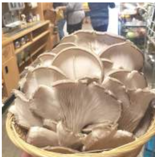
Blue Oysters Mushrooms locally cultivated in Bandon.