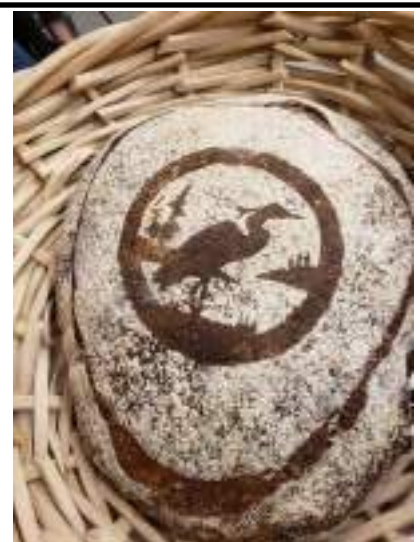
Farmstead Bread made a special bread with the South Slough logo for the Earth Day Fair.