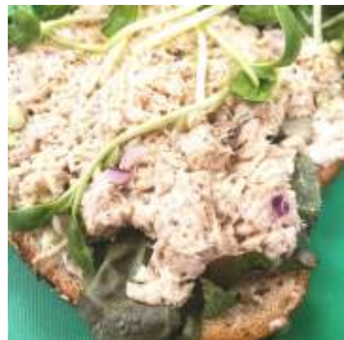
Seafare Pacific Albacore Tuna Salad Sandwiches, Available Every Day at the Grab & Go Deli!