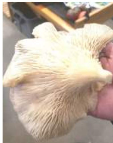
Locally-foraged Wild Oyster Mushrooms