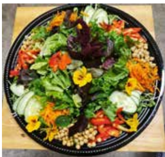
Pictured Left: Green Garden Salad made for the Deli's first official catering order!

Thanks again for being the most important part of our Deli team. We couldn't do it without you!